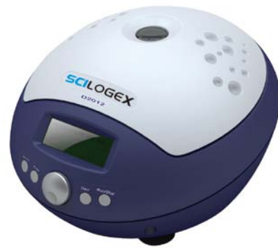
D2012 High Speed Micro Centrifuge